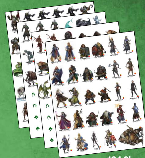
124 Character and Monster Pawns (plus 4 sets of action tokens)