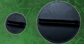
13 Plastic Pawn Bases (including 1 large base)