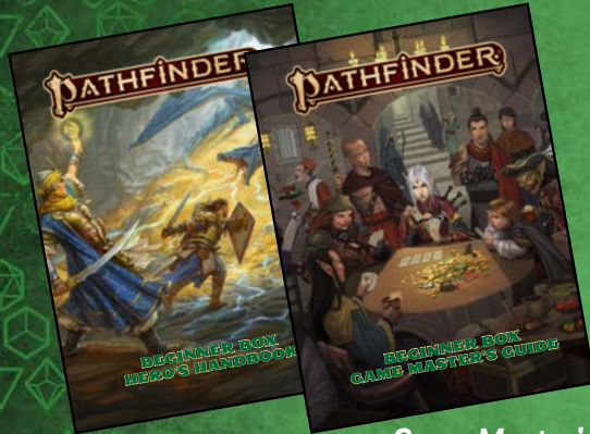
Game Master's Guide