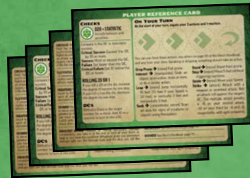
4 Player Reference Cards