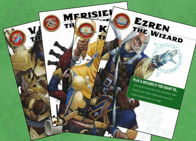
4 Pregenerated Character Sheets